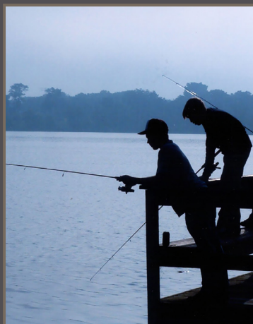
opportunities to enjoy