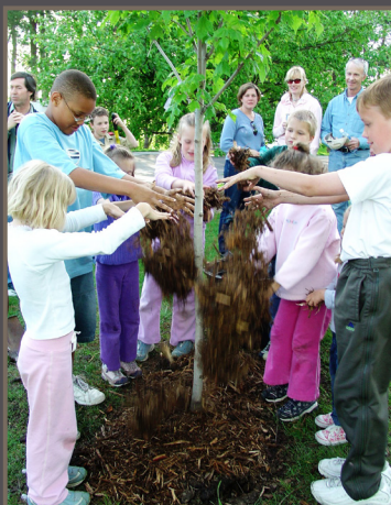
opportunities to learn