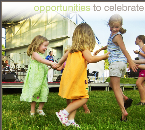
opportunities to celebrate