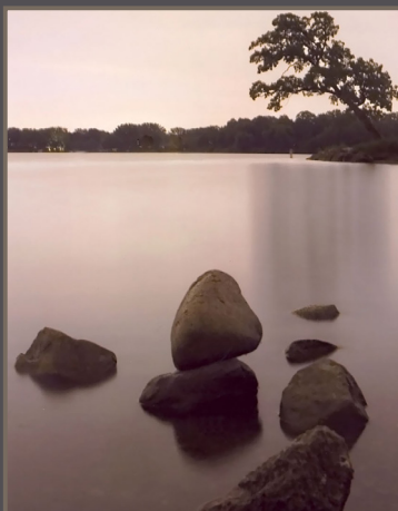
opportunities to breathe