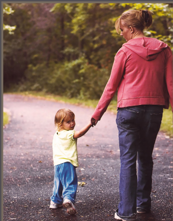
opportunities to explore