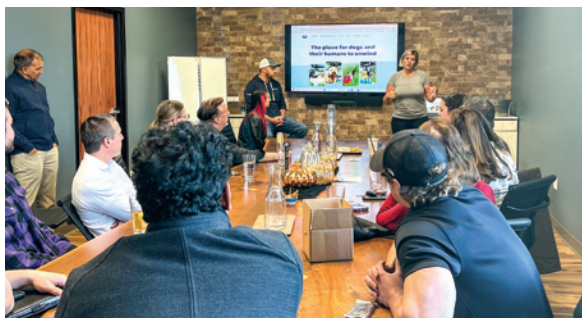
The Small Business Networking Group meets monthly to connect Plymouth-based businesses and entrepreneurs.

Meeting locations vary, offering Plymouth businesses an opportunity to host and participants a chance to explore the city. The group has met at PickleX, Rock Elm Tavern, Lago Tacos, Luce Line Brewing and the Plymouth campus of St. Cloud State University.