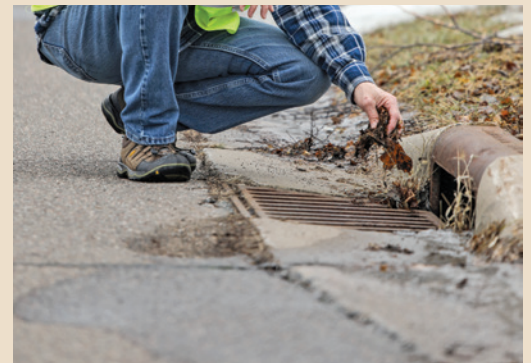
Adopt a storm drain in Plymouth to keep clear of leaves, yard waste and trash to prevent stormwater pollution.

Adopt a Storm Drain – Help keep storm drains clear of leaves, yard waste and trash to prevent stormwater pollution by volunteering in the Adopt a Storm Drain program. While anyone may clean storm drains, registering to adopt a storm drain allows city staff to properly inventory drains and log participants' volunteer time. Adopt a Storm Drain volunteer positions are not supervised, and can be a great introduction for residents of all ages to begin volunteering. To adopt a storm drain, visit plymouthmn.gov/adoptaspot – those interested can select a location from an interactive map of Plymouth.