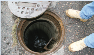
"Flushable wipes" clog the sewer system and can cause backups.

– The City of Plymouth reminds residents to protect sewer lines by not flushing cleaning wipes, baby wipes (even if they say they’re flushable), paper towels, napkins or sanitary items down the toilet. These items clog the sewer system and can cause backups into homes. To keep the system running smoothly, residents should throw the items in the trash and not flush anything other than toilet paper.