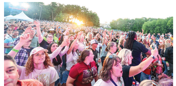
Hilde Nights is a free outdoor concert series featuring a variety of musical genres Friday evenings throughout the summer.

The second show in the series is set for 6:30-10 p.m. Friday, July 11. Rival 5 performs at 6:30 p.m., bringing powerhouse vocals and big harmonies to the stage with hits from the '70s