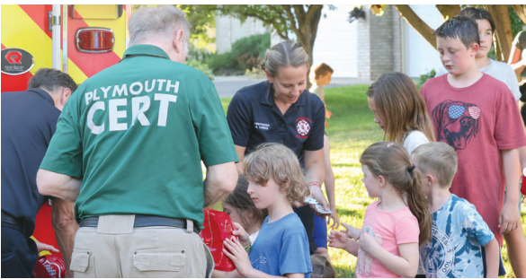
Plymouth Public Safety, Public Works and elected officials visit registered block parties each year during Night to Unite.

All registrants will also be entered into a drawing for a chance to win prizes, which include gift cards, rides to school in a fire truck, tours of the Plymouth Police Department, and