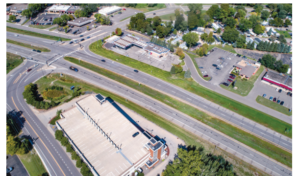
The area around Highway 55 and County Road 73 will undergo major transformation during the Station 73 TRIP project.

As the project continues, lane closures, full closures and detours may occur. Stay up to date with the latest information at plymouthmn.gov/station73trip .